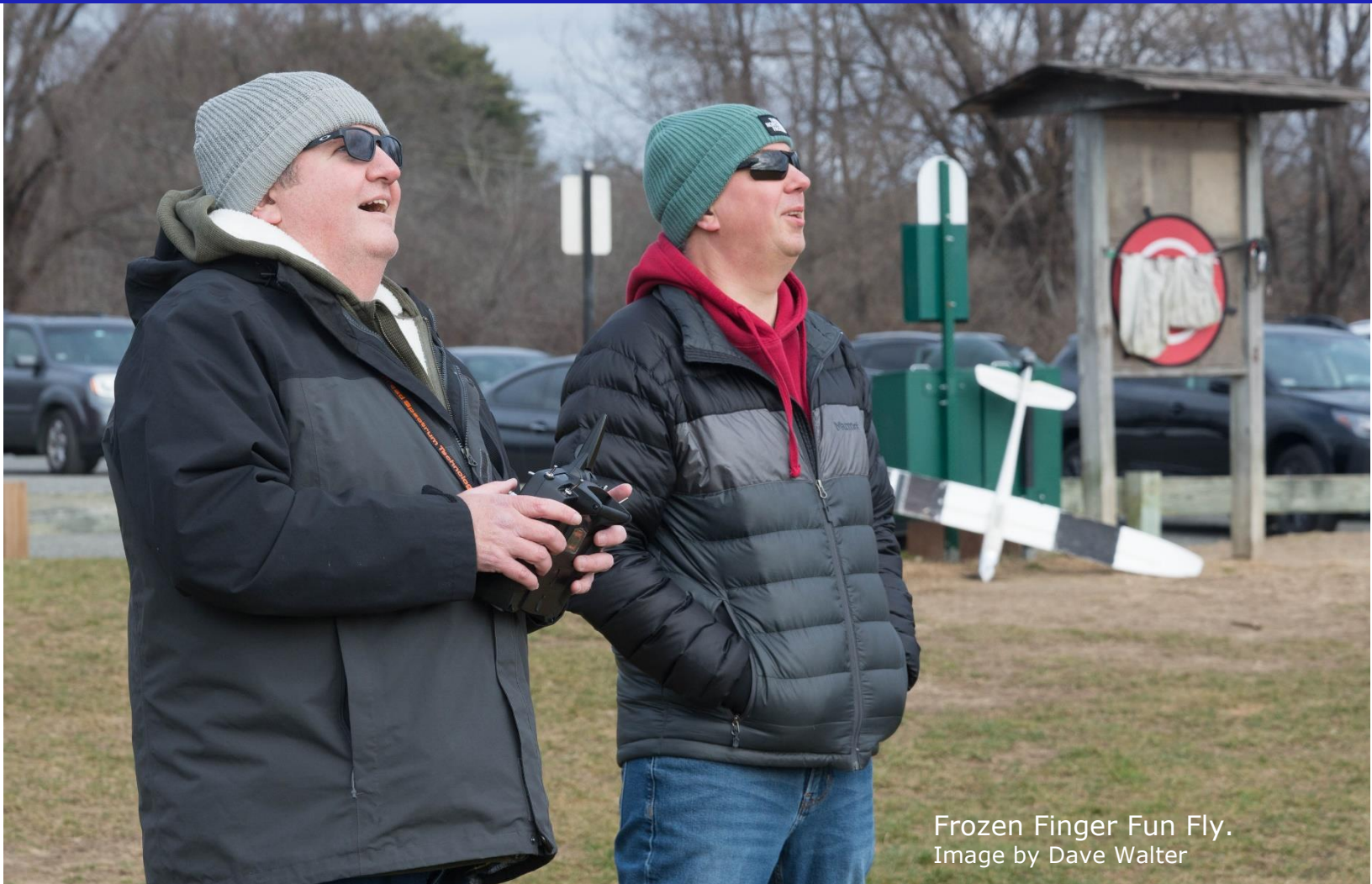
Frozen Finger Fun Fly.