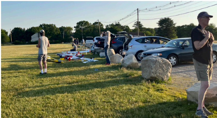
Activity at School Street on a beautiful early-June Wednesday evening.

The cricket league / teams have field reservations Tuesdays, Thursdays, and Fridays, typically showing up around 5 and going until dark - let's respect their times. Please cooperate with other ad-hoc field users/spectators at times when no group has a reservation, and of course always fly with safety in mind. When more than one flyer is present, observe a "flight line" near the parking side of the field, and call out for take-off, landing, on-the-field, etc. Do not fly over/behind School Street, or near Route 2.