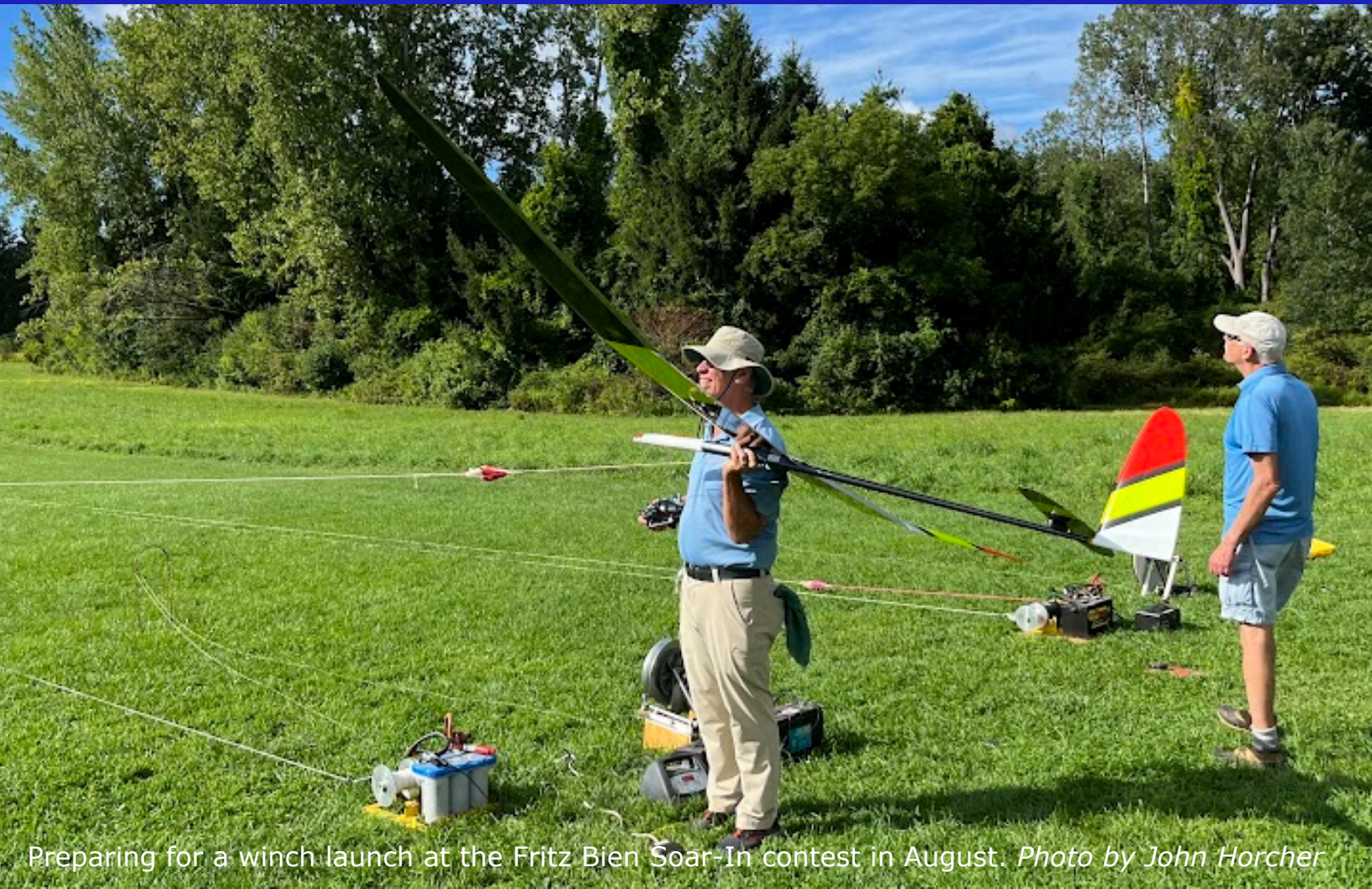
Preparing for a winch launch at the Fritz Bien Soar-In contest in August.