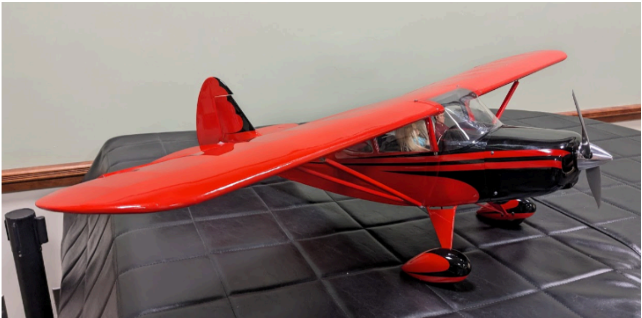
Jimi Two-Feathers brought this neat recently acquired model to the November meeting.