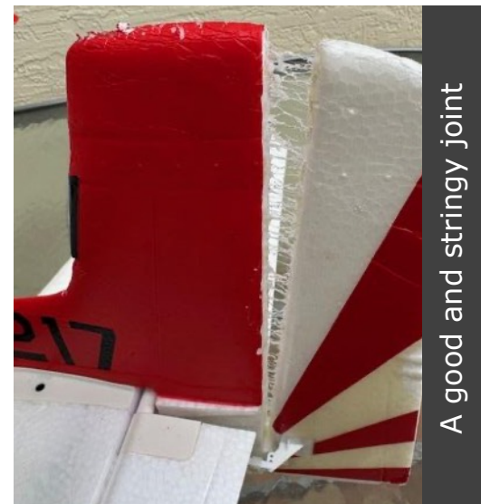
A good and stringy joint