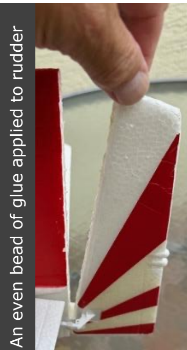
An even bead of glue applied to rudder

Apply a bead of Foam Tac to one side of the hinge joint evenly. Squish the two pieces together. The glue will wet both sides. Now pull the two pieces apart and repeat until the glue becomes thicker and stringy. Now separate the pieces one last time. Let the glue sit for one to three minutes to dry. The rudder can now be pushed in place and left to harden.