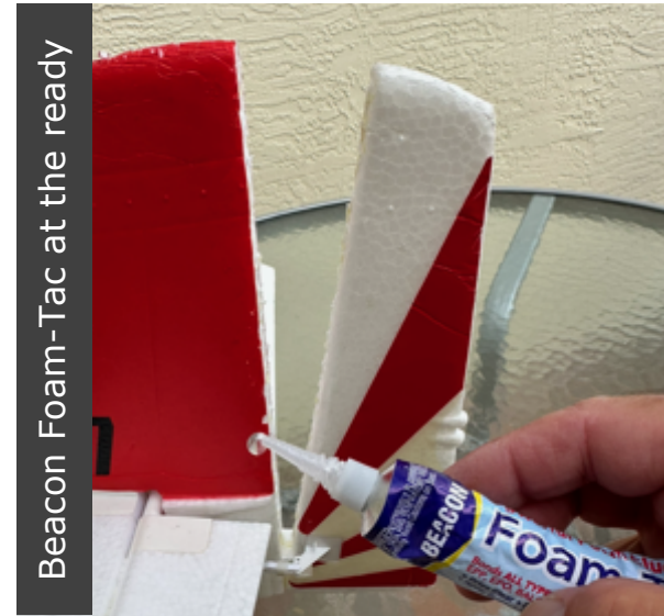
Beacon Foam-Tac at the ready

To fix this hinge I decided to use Foam-Tac. There's a great video on this and I'll demonstrate it for you here. Link at the end of this article. Removal of loose tape, glue and paint is crucial. Easy enough to do with a good tweezers or pliers. I was lucky the foam stayed together well or I would have removed the loose bits.