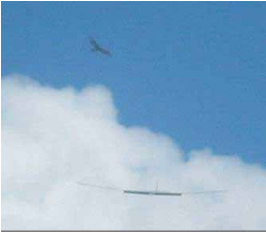
A hawk was present during the contest. This sailplane was chased while slowing for a landing.

from a cloudless sky. Almost all day we were in the middle of a blue hole surrounded by towering cumulus clouds.