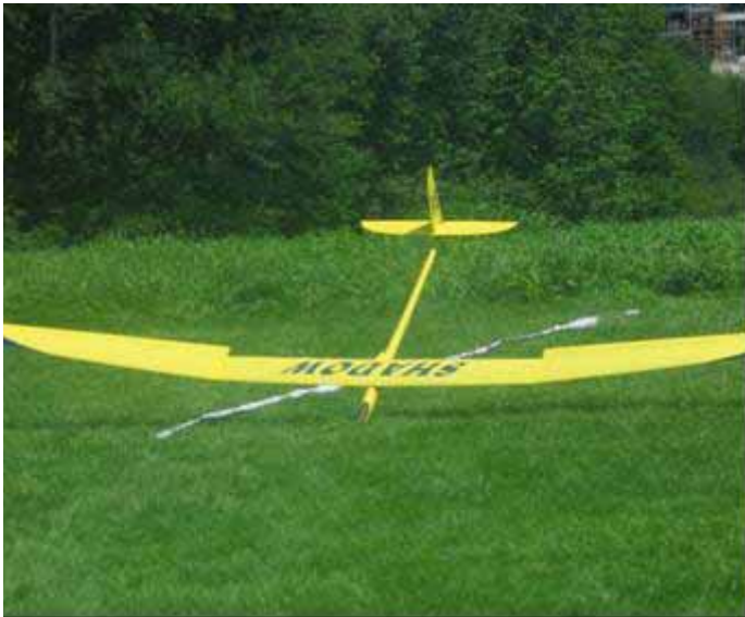
This Shadow scores a 92 and perfect timing.

Competition was intense with landings making the difference. At the end of the day the two top experts had identical raw scores and a tiny difference in normalized scores. The 2nd and 3rd place experts had identical normalized scores with the tie broken by raw scores.