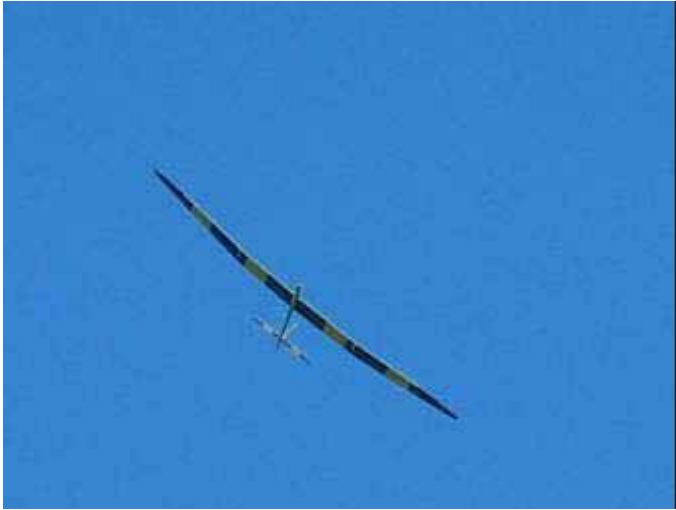
A Pike perfect flies low over the end of the field. Several Pike Perfect sailplanes were at this event.

Competition was intense with landings making the difference. At the end of the day the two top experts had identical raw scores and a tiny difference in normalized scores. The 2nd and 3rd place experts had identical normalized scores with the tie broken by raw scores.