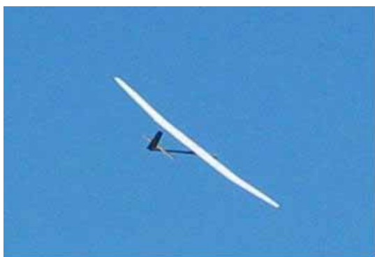
A Supra cores a thermal at the end of the field. The Supra was the most popular sailplane of the day.

Again, landings made all the difference with the majority of the experts getting all their flight times. The final results were: