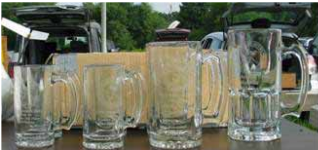
The day's awards were on display. The largest cup was for the weekend grand champion.